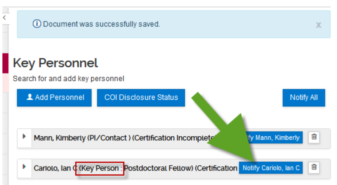
Figure 1 – PHS Active Notify Button